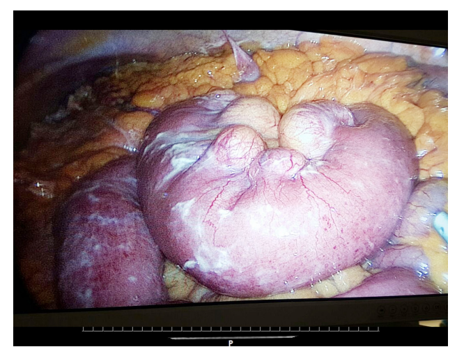
Fotograf 2: Açıklama